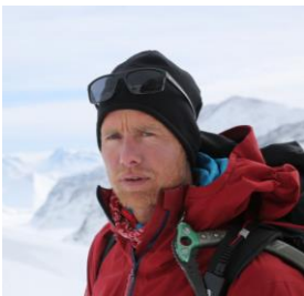
Leo Houlding Adventure