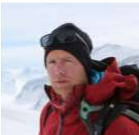
Leo Houlding Adventure